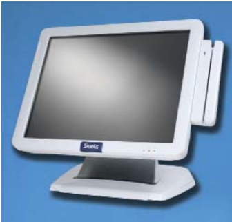
White Cabinet Color Available by Special Order