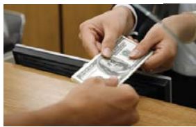
Hotel Front Desk / Airline Counters / Financial