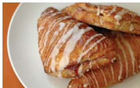
Dusty Environments Like Pizza and Bakeries