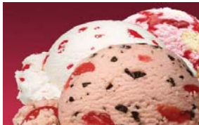
Coffee Shops / Ice Cream / Convenience Stores