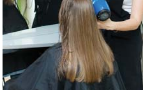
Medical / Automotive Services / Salons