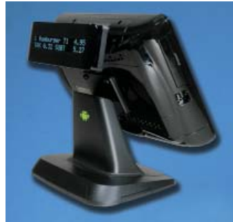
Optional Integrated VFD Customer Display