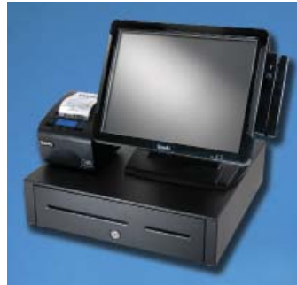
Two Cash Drawer Ports Supports Optional Cash Drawers