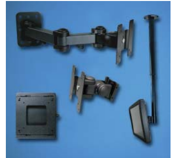
Standard VESA Configuration Fits a Variety of Wall and Ceiling Mount Brackets