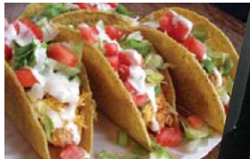
Table Service / Quick Service Restaurants